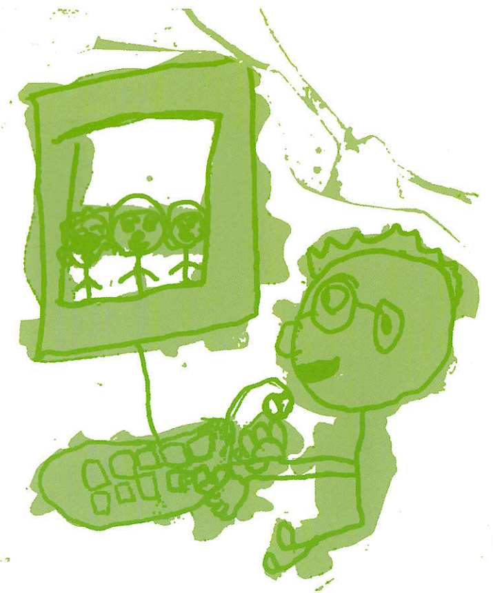
Artwork by a child with autism, who entered our 'make school make sense' art competition.

Our survey suggests that there is considerable scope for the inclusion of people with autism in the workplace and that many employees would be supportive of such initiatives. But there's a gap between what people say they would do and the reality for people with autism. Appropriate training and support would be needed for employers and employees to ensure that people with autism are actually welcomed into the workplace and supported day-to-day.